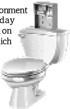
New 'pay as you go' toilet

Minister for the environment Martin Cullen today announced a new tax on visits to the toilet, which has already been dubbed the 'turd tax'. He said, "the government is firmly attached to the 'polluter pays' principle and in this case it