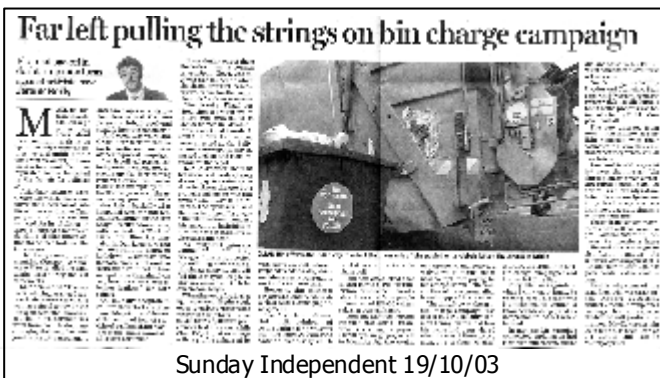
Sunday Independent 19/10/03

We'd like to go beyond this. We'd like to put our hands up and say 'yep we are involved in this campaign and have been from the start of it three years back'. At various points our members have been on the steering committees of 3 of the 4 Dublin campaigns and one of our Cork members was jailed back in May 2001 for his role in the campaign there. Oh, and as well as taking direct action at Shannon and being involved in RTS, we have also helped bring the Women on Waves ship to Ireland, rioted against the IMF in Prague, trespassed at