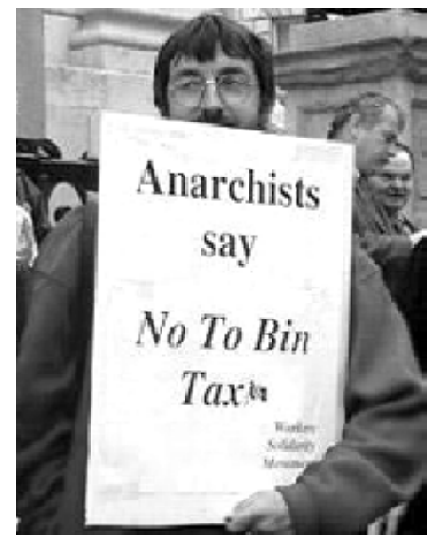
A funny way to 'infiltrate'

Wouldn't it be great if the Sindo's 'far left scare' backfired. If rather than scaring the tens of thousands involved in the anti bin tax campaign it meant they said 'maybe we should check out this crowd that are giving O'Reilly sleepless nights. Maybe its time to wake up, have a look around and get organised.'